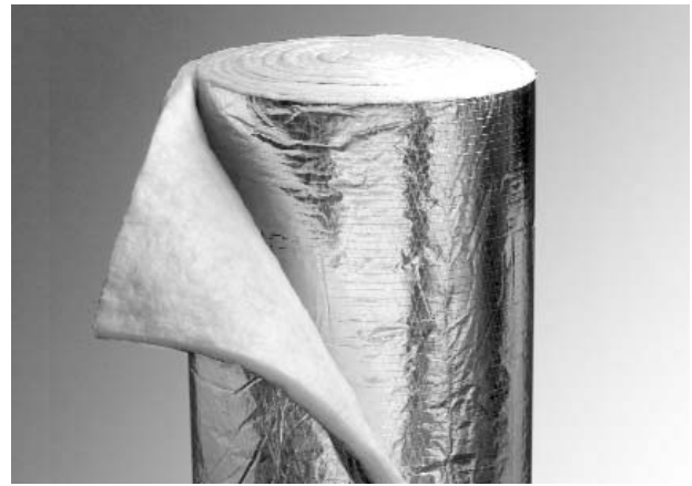
Operating Temperature Limits: 40°F to 250°F (4°C to 121°C) Faced