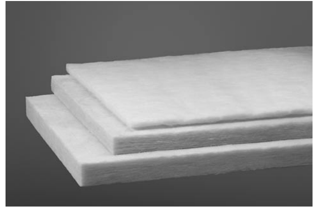
Operating Temperature Limit: 850°F (454°C)